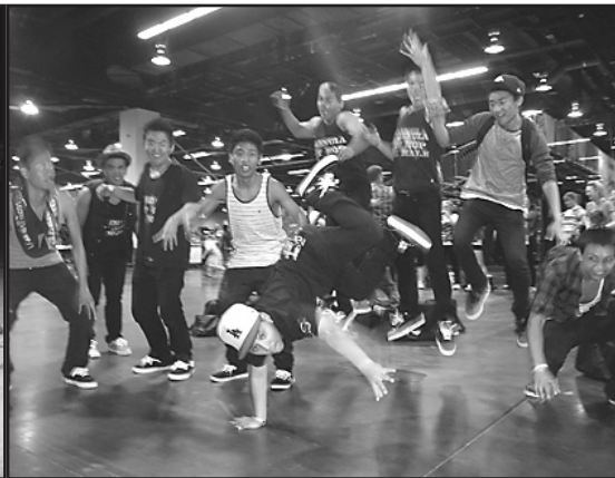
BOTH GIRLS AND BOYS DANCE TEAM SHOWING OFF THEIR NATURAL TALENTS.