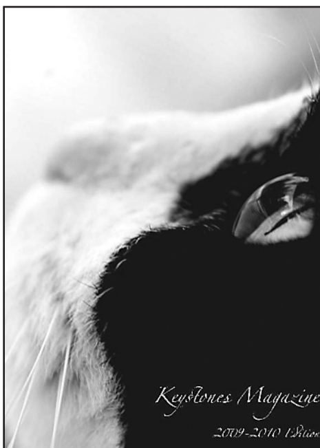
THE 2009-2010 KEYSTONES IS OUT. GET YOURS TODAY.